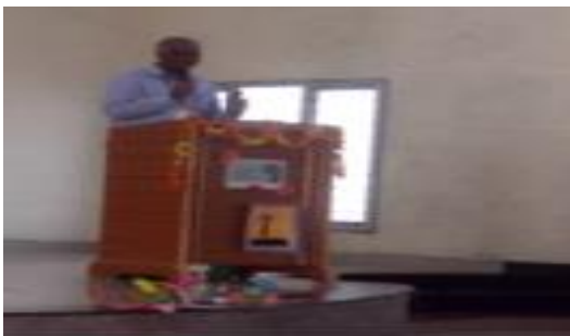
Principal's sir speech