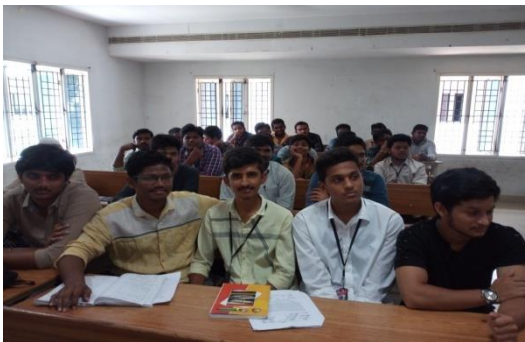
Boy's students attended the workshop